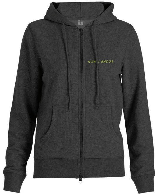
NOW ZIP HOOD [CHARCOAL HEATHER]