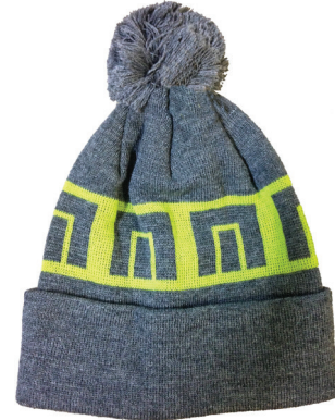
TEAM BEANIE [CHARCOAL/GREEN]