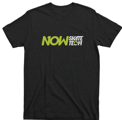
SKATE TECH TEE [BLACK HEATHER]