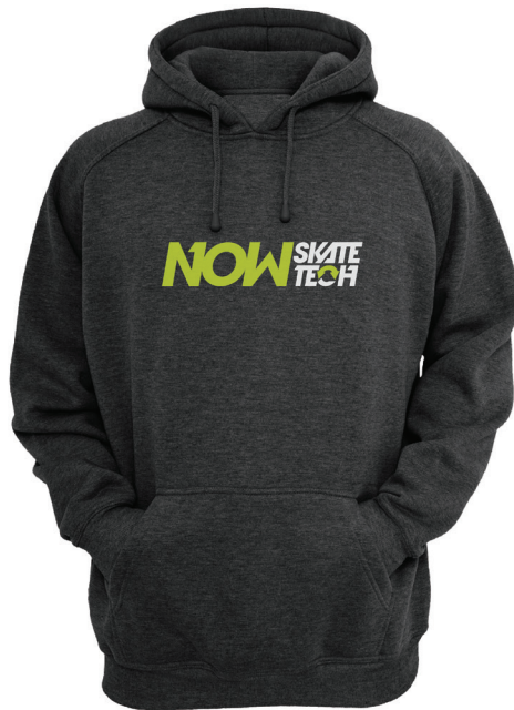
SKATE TECH HOOD [CHARCOAL HEATHER]